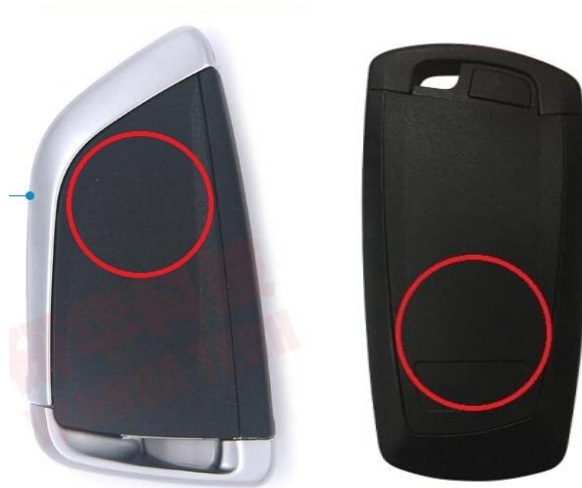
Pic. 2 Emergency-Start coil position

Put the key marked with red (see above pic.2) on the coil.